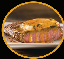
Six Shooter Cajun Butter Rubbed with a zingy blend of six herbs and spices