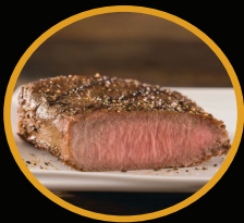
Hickory Grilled & Lightly Seasoned For that classic Rafferty's flavor