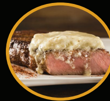
Bleu Cheese Butter Made with fresh bleu cheese crumbles