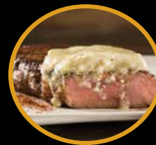
Bleu Cheese Butter Made with fresh bleu cheese crumbles