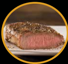
Hickory Grilled & Lightly Seasoned For that classic Rafferty's flavor