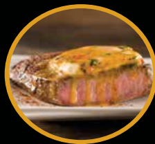
Six Shooter Cajun Butter Rubbed with a zingy blend of six herbs and spices